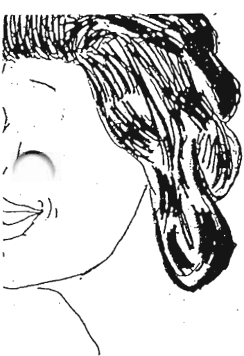
EMALE FIREFIGHTER HAIRSTYLE