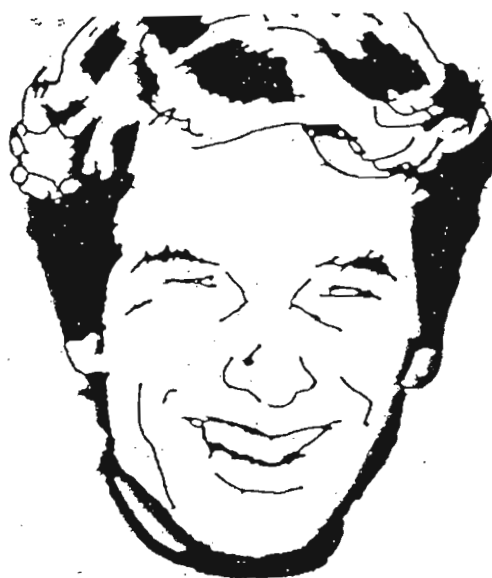
HAIR OVER THE EAR LOBES